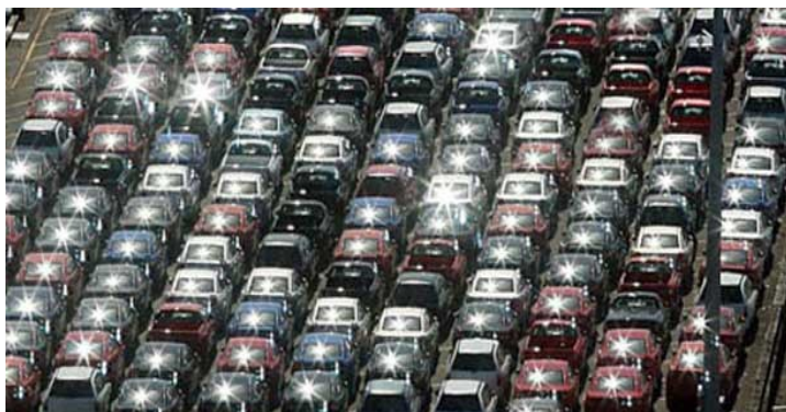
Source: Stuff. (2014). NZ's new vehicles sale surged in 2013. Retrieved from: http://www.stuff.co.nz/motoring/news/9584377/NZs-new-vehicle-sales-surged-in-2013